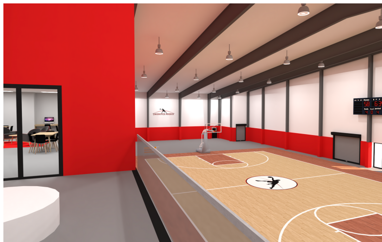
Main basketball court view from the mezzanine

There is an essential next chapter to serve more students of our community. More than 60% of all Indian River County school-age youth are on free and reduced cost lunch. This equates to 10,000 low-income youth in need of support. Fewer than 2,000 of these students participate in high-quality after school programs such as Crossover, Gifford Youth Achievement Center, Boys & Girls Clubs of Indian River County, Big Brothers Big Sisters, Youth Guidance Mentoring Academy and Dasie Hope Center. The need for additional enrichment student support exceeds the capacity of our existing network. As such, after careful planning and due diligence, Crossover has implemented a transformative plan to quadruple the number of students it can serve each year; each student receiving the in-depth support necessary to change the trajectory of their future.