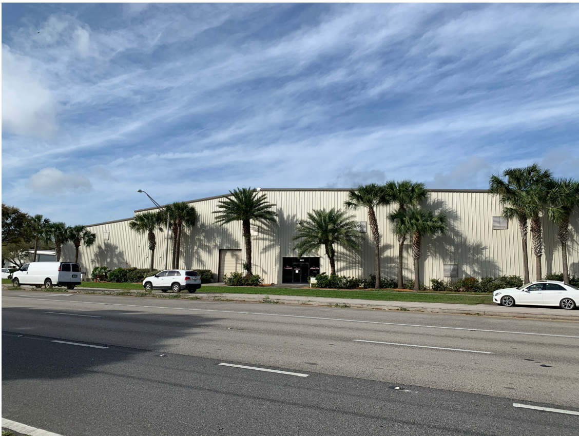
Crossover Mission Center for Excellence

"Crossover is committed to helping people with their schoolwork and I appreciate that. After I graduate high school I want to go to college and get a really good job. I know Crossover can help me get there."